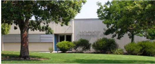
Mathematics and Science Building