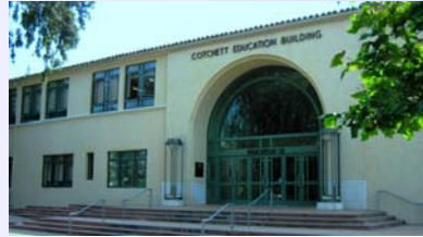
Cotchett Education Building